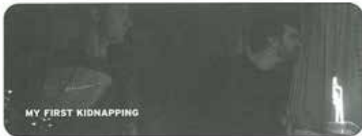
MY FIRST KIDNAPPING

112 George St 2nd Floor Brooklyn, NY 11237 646-825-1801 jintrator@gmail.com