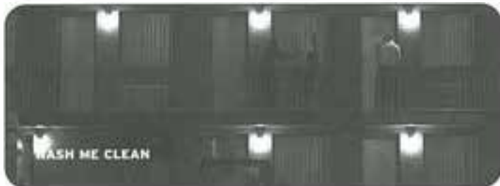
WASH ME CLEAN