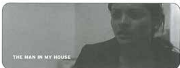
THE MAN IN MY HOUSE