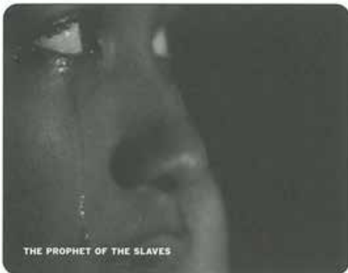
THE PROPHET OF THE SLAVES