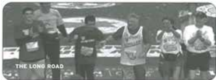
THE LONG ROAD