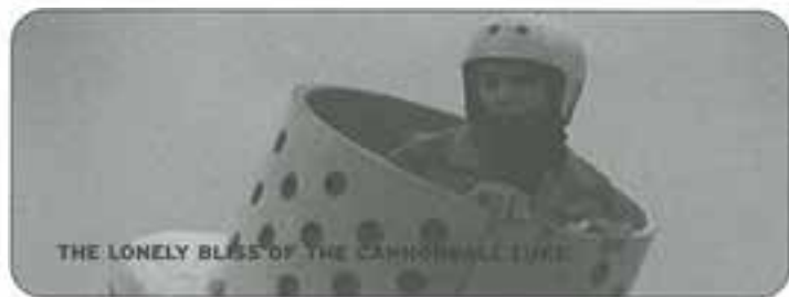
THE LONELY BLISS OF THE CANNONBALL LUKE