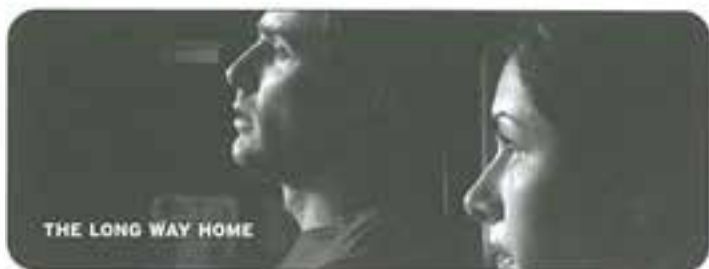
THE LONG WAY HOME