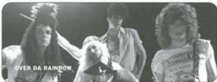
OVER DA RAINBOW