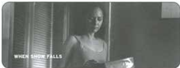
WHEN SNOW FALLS