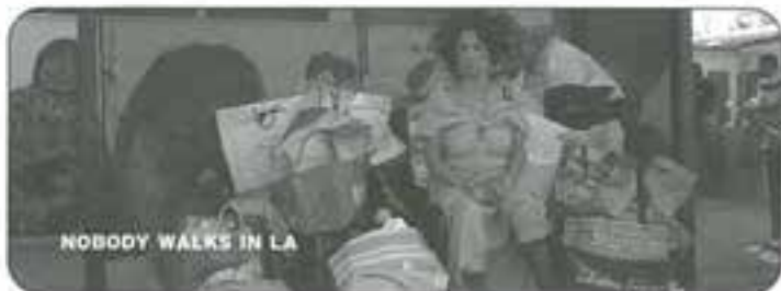
NOBODY WALKS IN LA